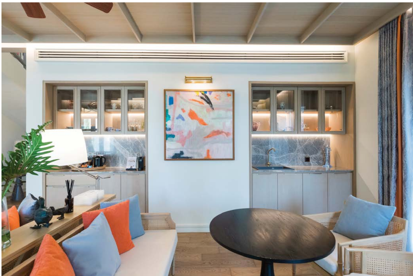
Reed Sea (2021) Charras Bhawan Beachfront Hotel and Residences