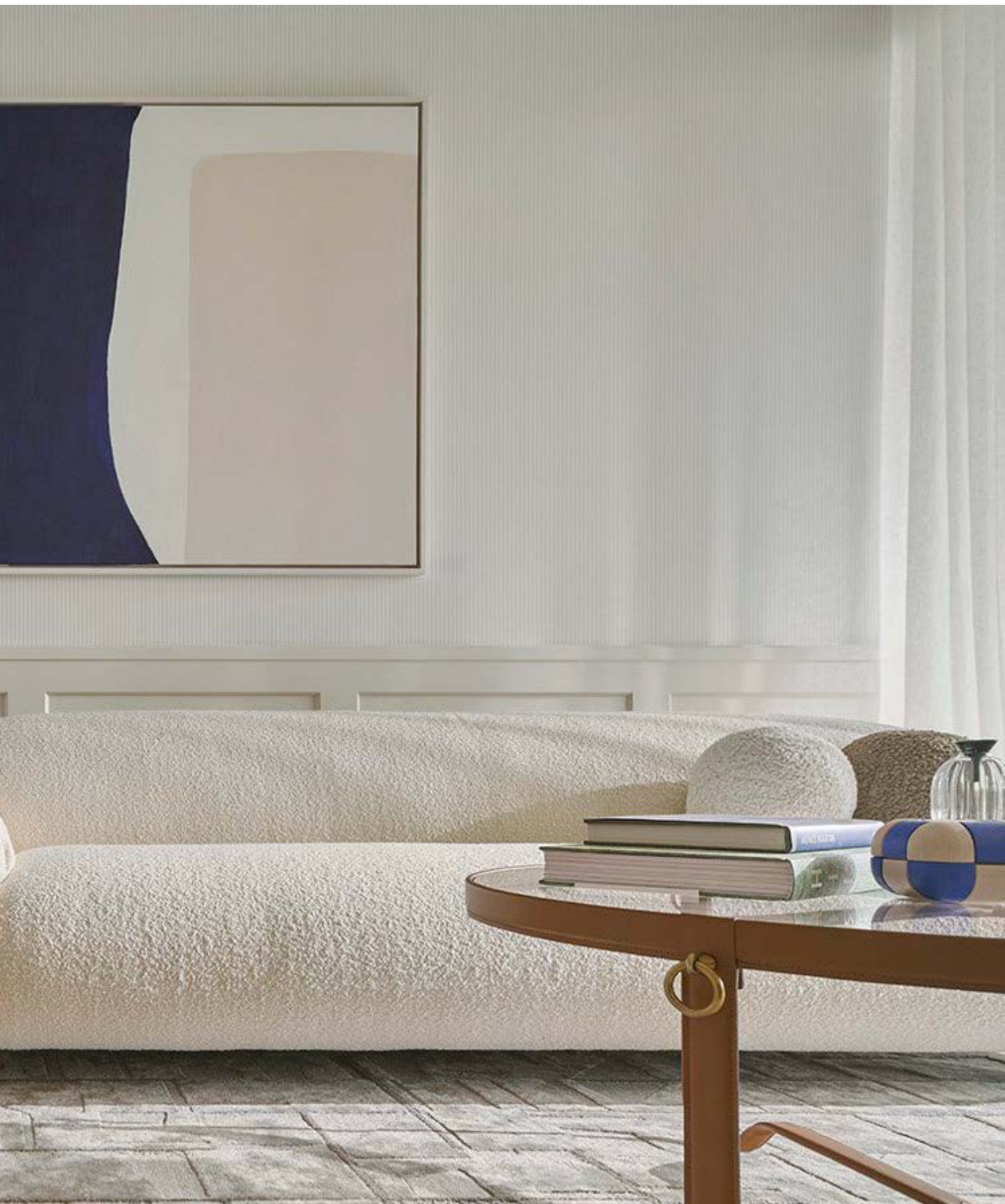
Pearl Dynamic (2023) (Left) and White Sand Blue Sea (2023) (Right)