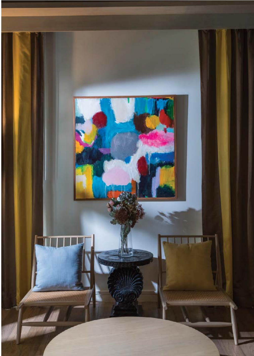
Reed Sea (2021)

Charras Bhawan Beachfront Hotel and Residences