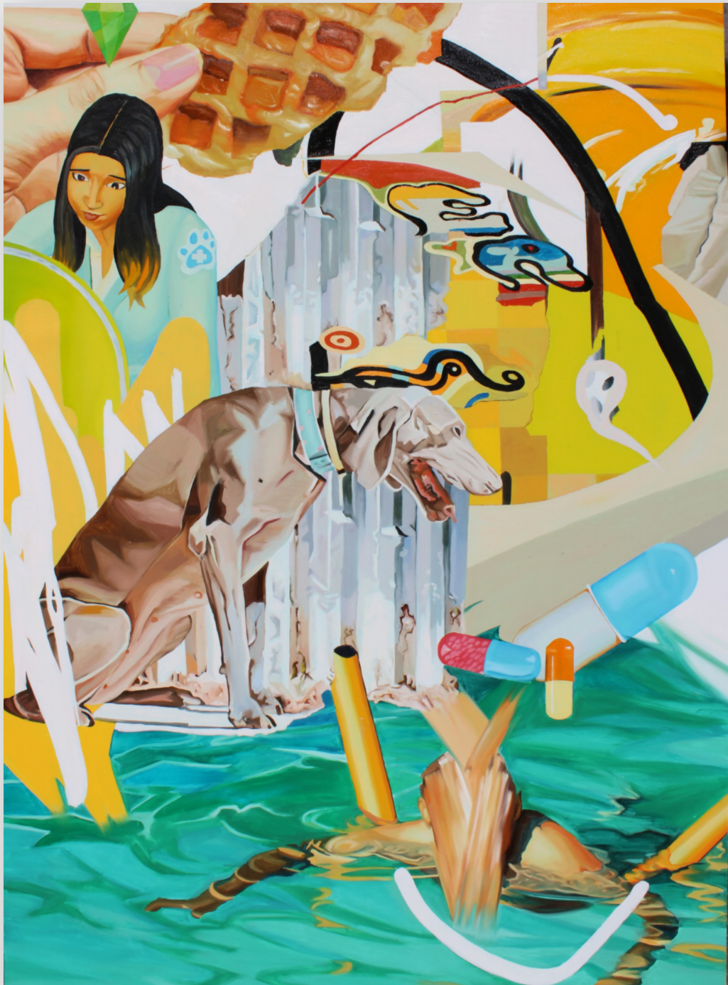
Yellow Sanity , 2021 Oil on canvas 170 x 120 cm