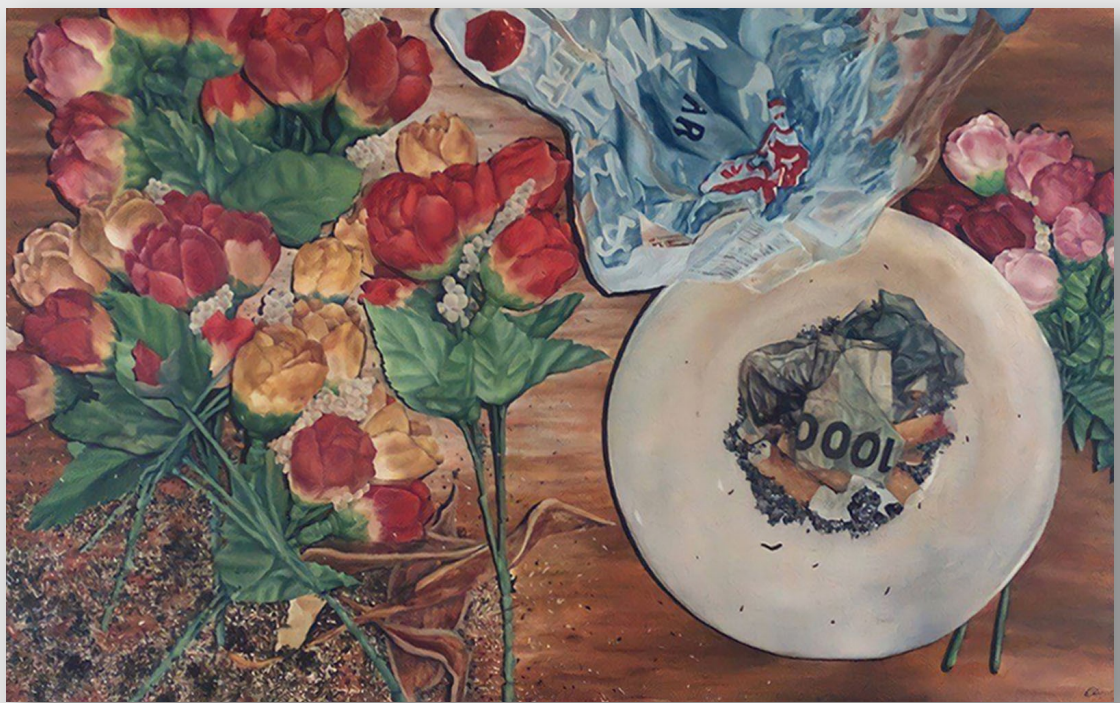
Roman Akhir Bulan, 2022 Oil on canvas 160 x 100 cm