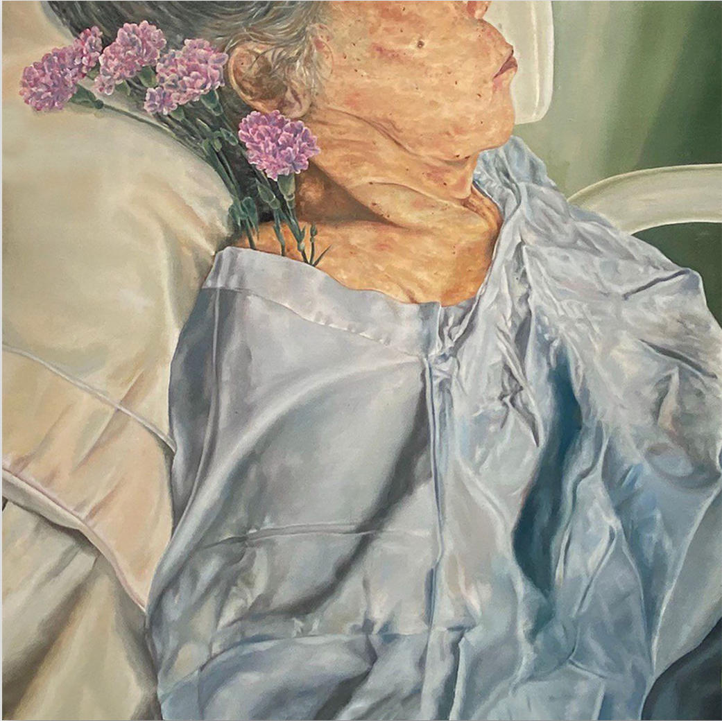
Mendengar Nafas, 2022 Oil on canvas 100 x 100 cm