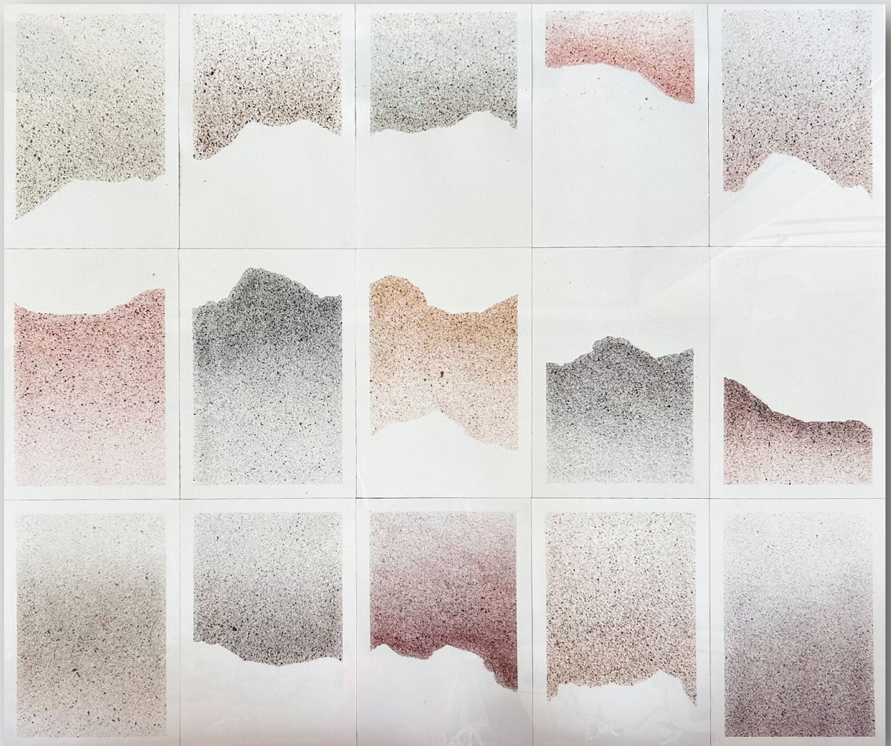
Catatan Warna Sukabumi, 2023 Natural Mineral pigment on cotton paper 95 x 85 cm