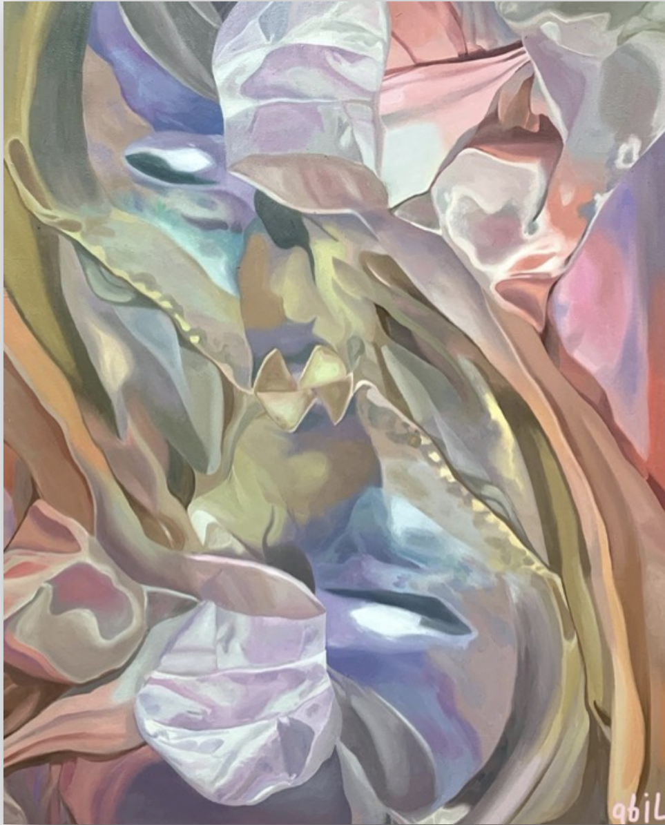
What We Thought We Knew, 2021 Oil on Canvas 100 x 80 cm