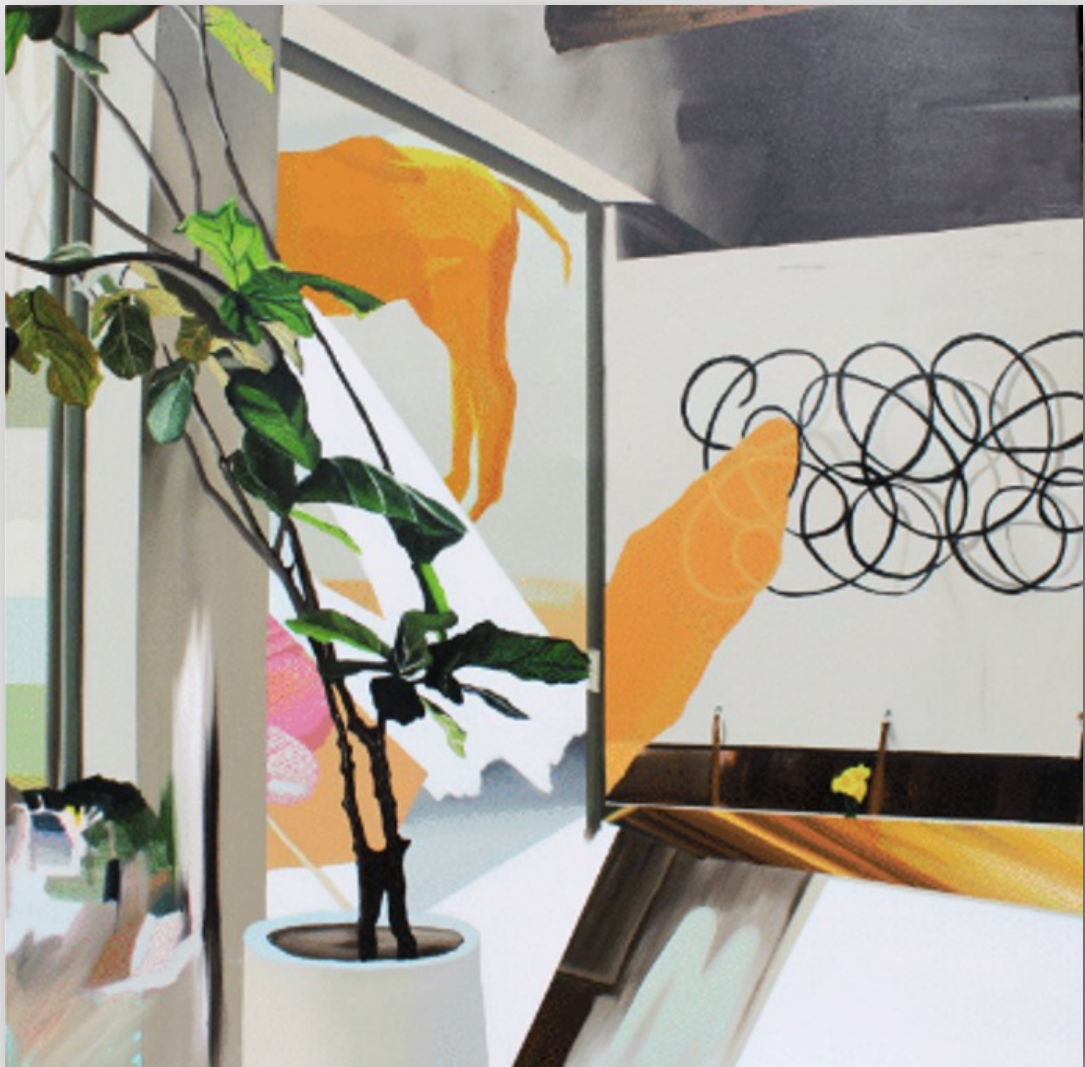
Ritakala, 2022 Oil and Linen 108 x 108 cm