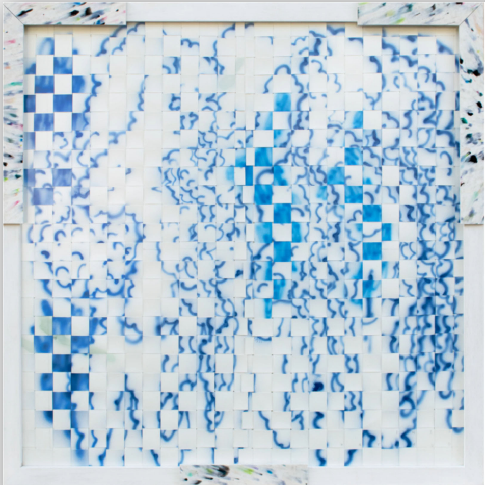
Intertwined 4, 2021 Non toxic ink on 300 gsm paper (acid free & mold resistant). Organic painting on wooden + recycled plastic frame 83 x 83 cm