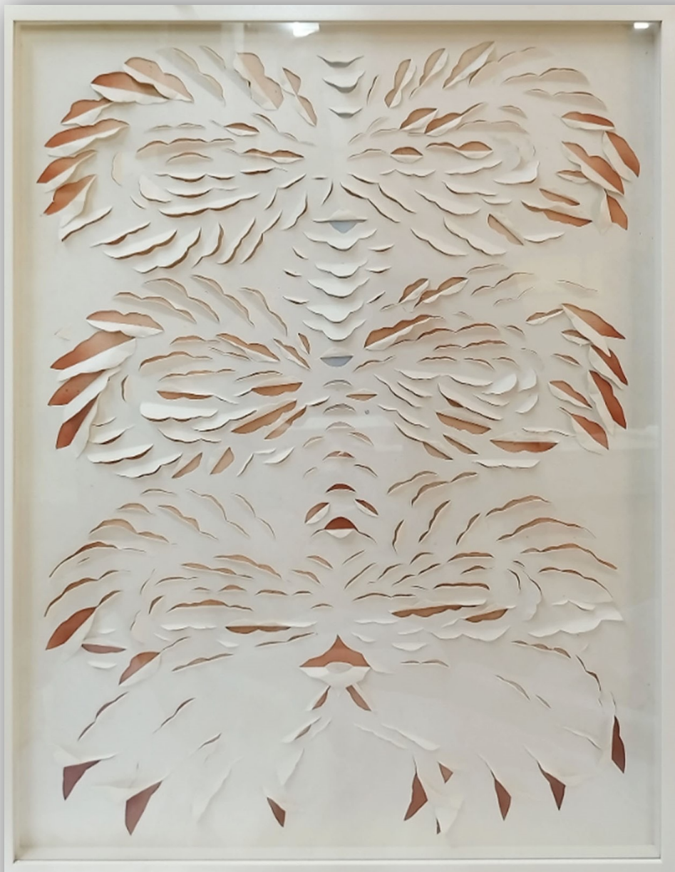
Intus 1, 2023 soil pigment, lapis lazuli stone, handmade banana paper, wooden frame 89 x 62 cm