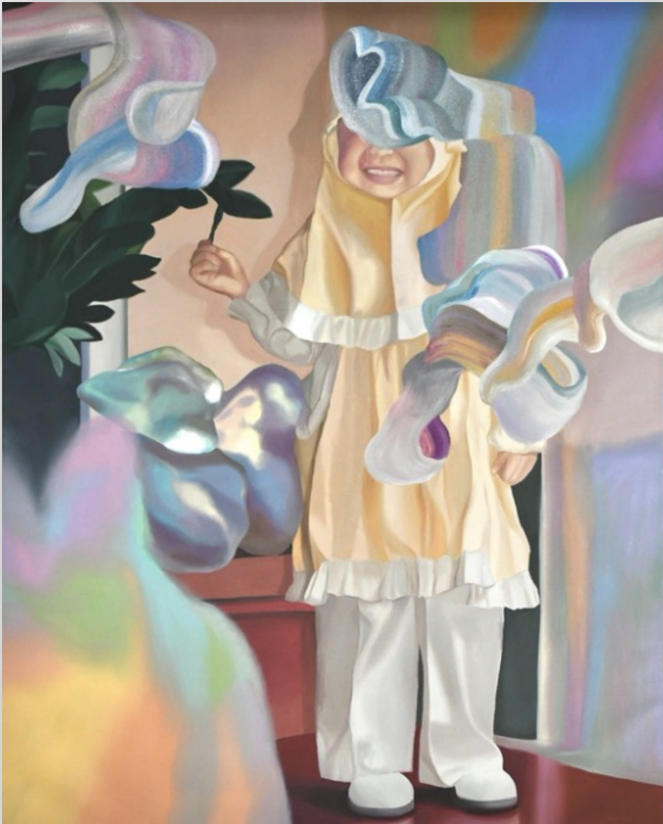
If We Ever Meet Again, 2023 Oil on Canvas 120 x 150 cm