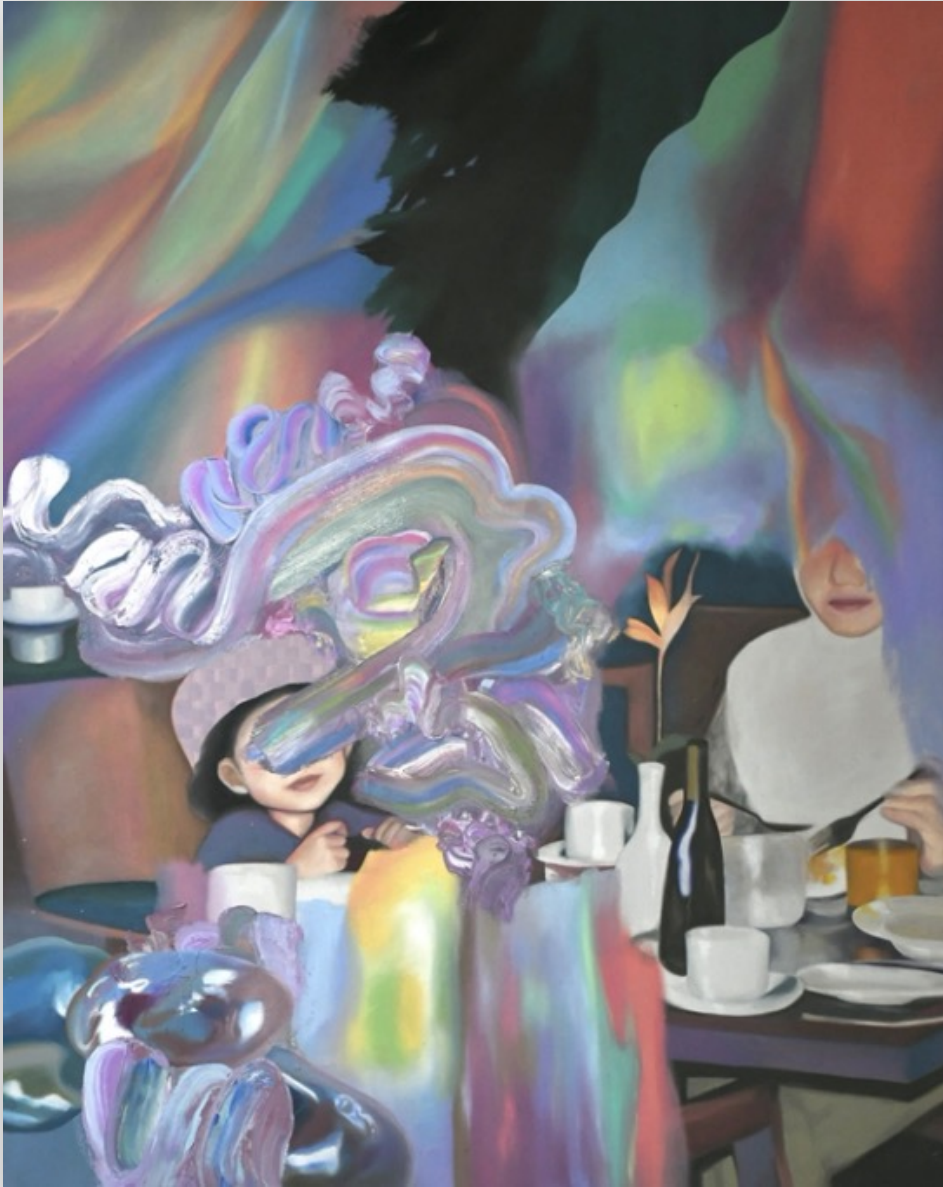
Hands of Time, Yours and Mine, 2023 Oil on Canvas 120 x 150 cm