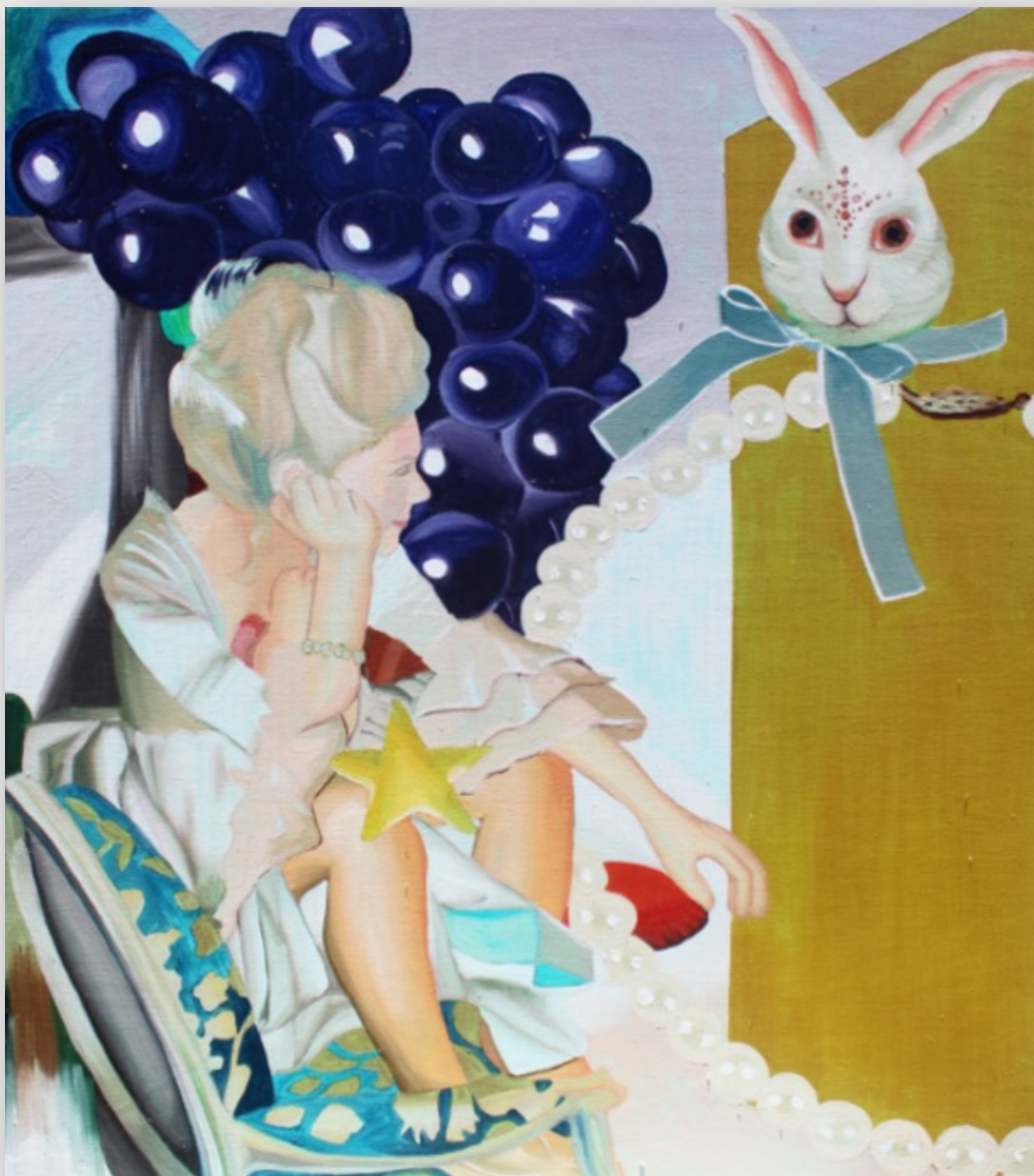
Marie on Set, 2023 Oil on canvas 80 x 70 cm