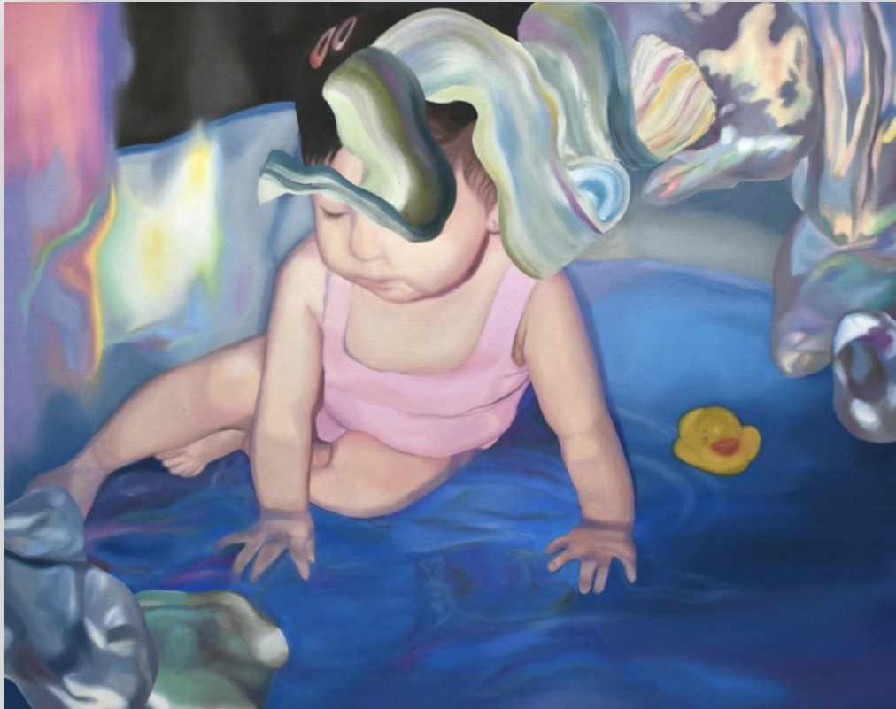
A Pool to Shed Your Memory, 2023 Oil on Canvas 150 x 120 cm